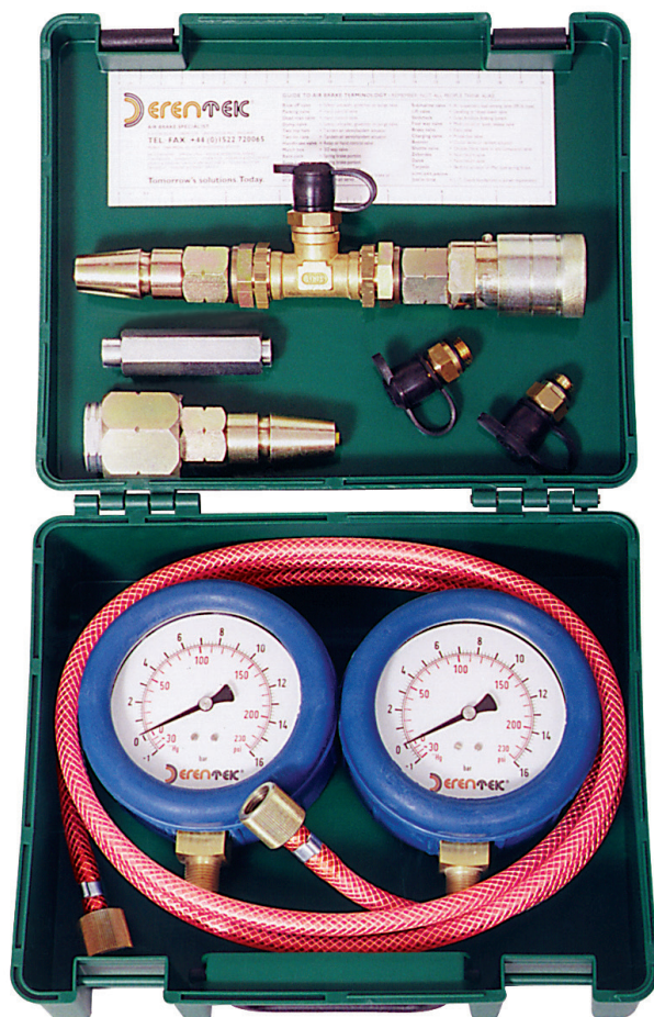
Part No. ETB001V

Two gauges measuring psi/bar and vacuum, with test couplings, tee-piece and two hoses for 16mm test points. Supplied with service-line coupling tester.