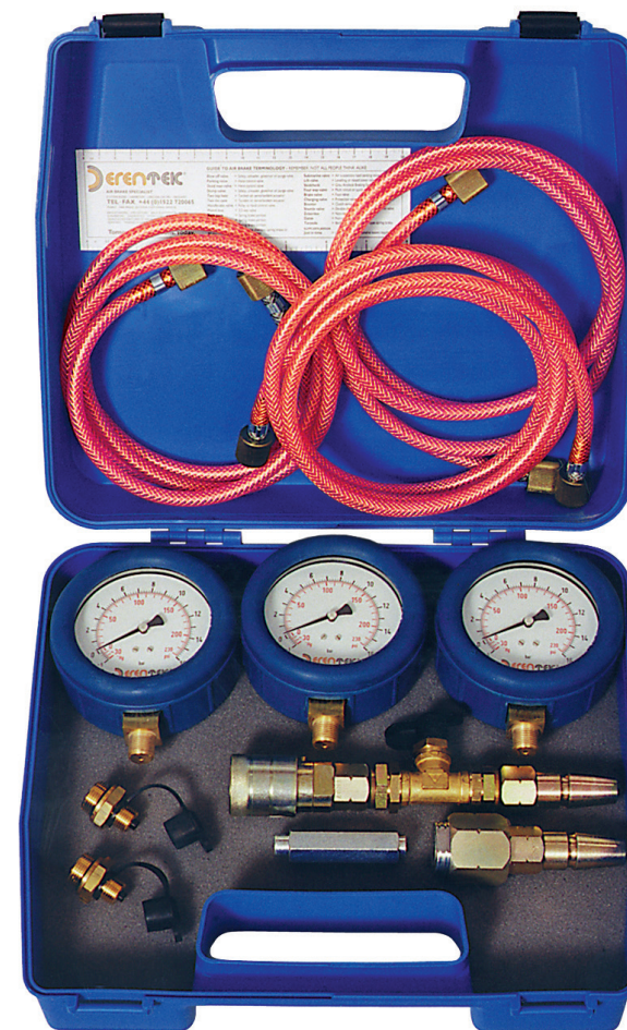
Part No. ETB003V

Test kit for setting or testing air suspension load-sensing valves, with two gauges measuring psi/bar and vacuum, and a range of test points. Supplied with service-line coupling tester.